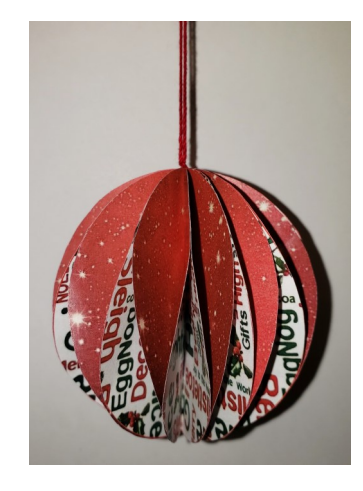
Your finished ornament is ready for hanging.

Adjust your ornament's pages as necessary to achieve evenly spaced pages. The photo at left shows how the ornament will look from above. Tie the end of the strings in a knot and trim as needed.